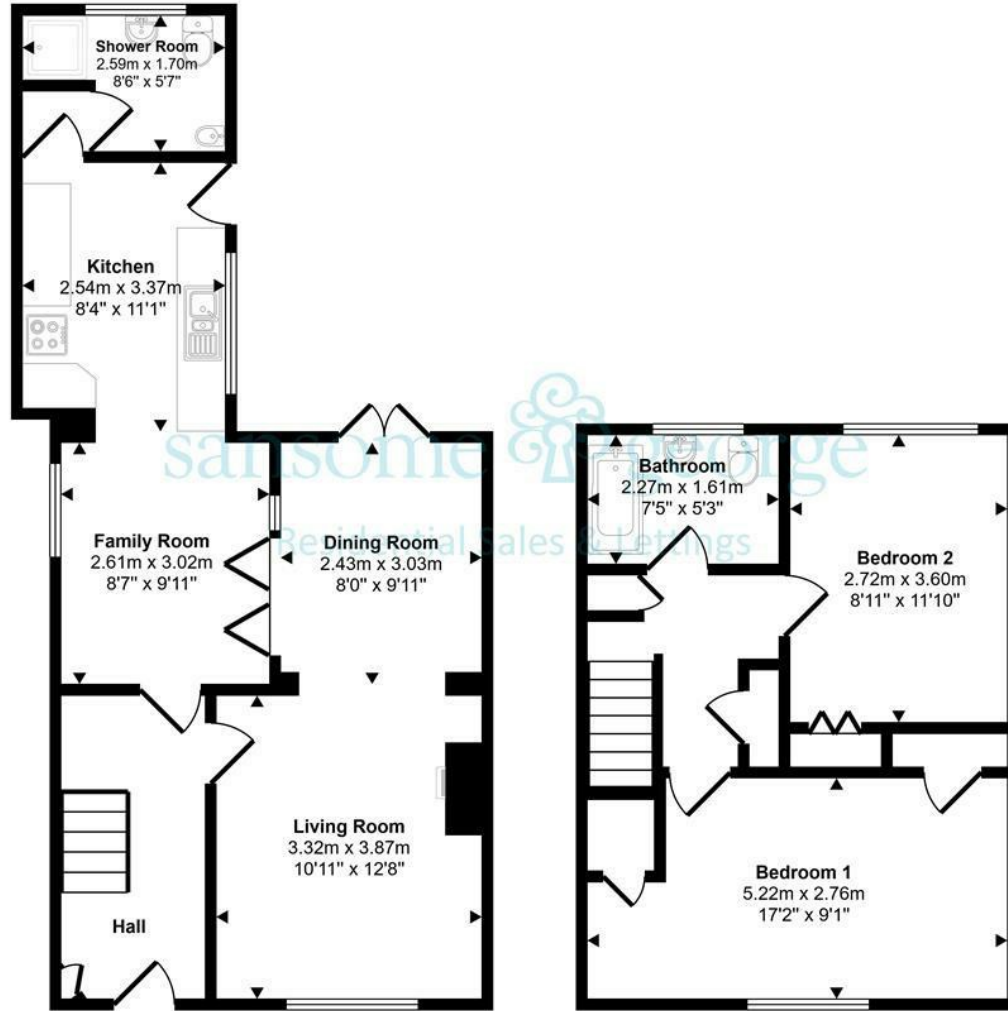
Ground Floor Approx 51 sq m / 544 sq ft

Approx Gross Internal Area 87 sq m / 938 sq ft